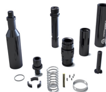
Peak 3D Releasable Overshot components

Our 3D imagery is intended to better communicate